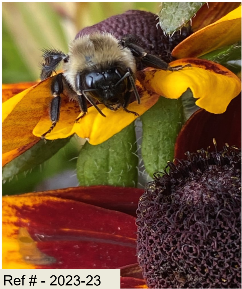
Ref # - 2023-23