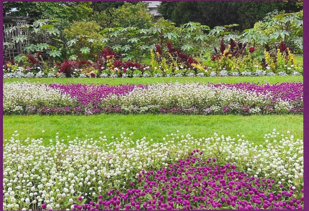
Ref # - 2024-02