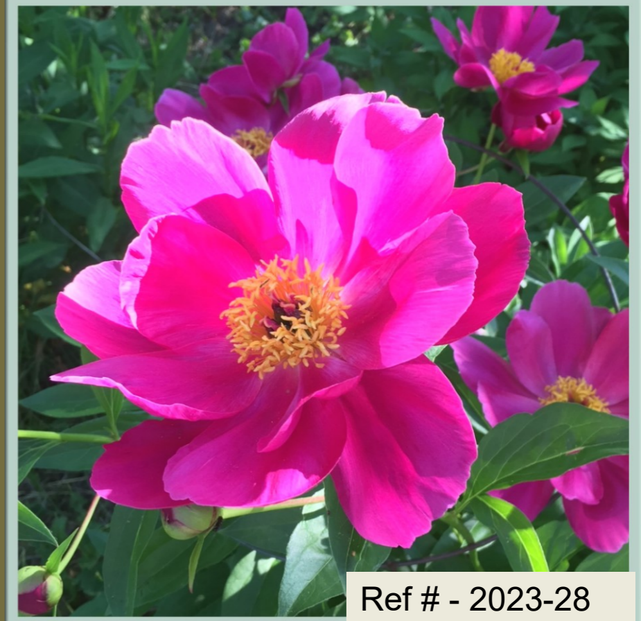
Ref # - 2023-28