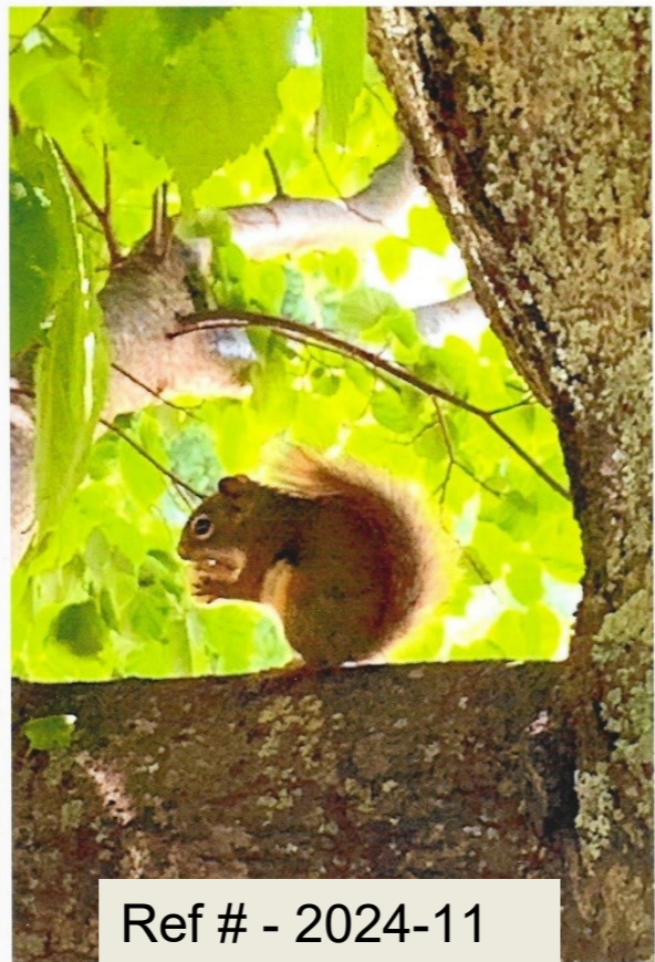
Ref # - 2024-11