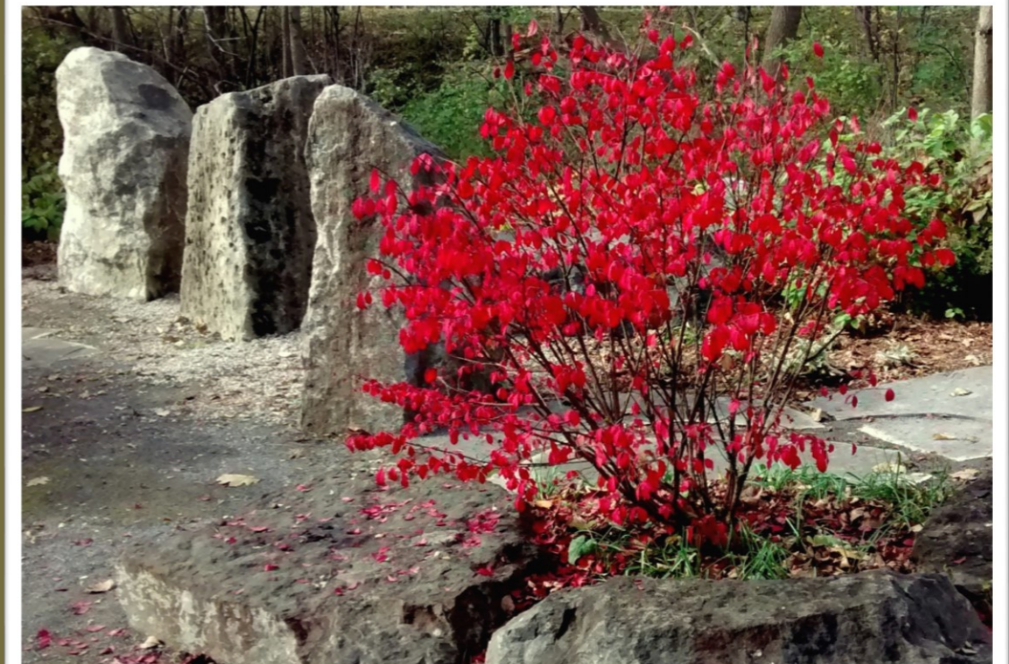
Ref # - 2023-35