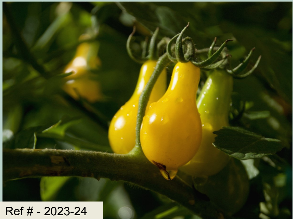
Ref # - 2023-24