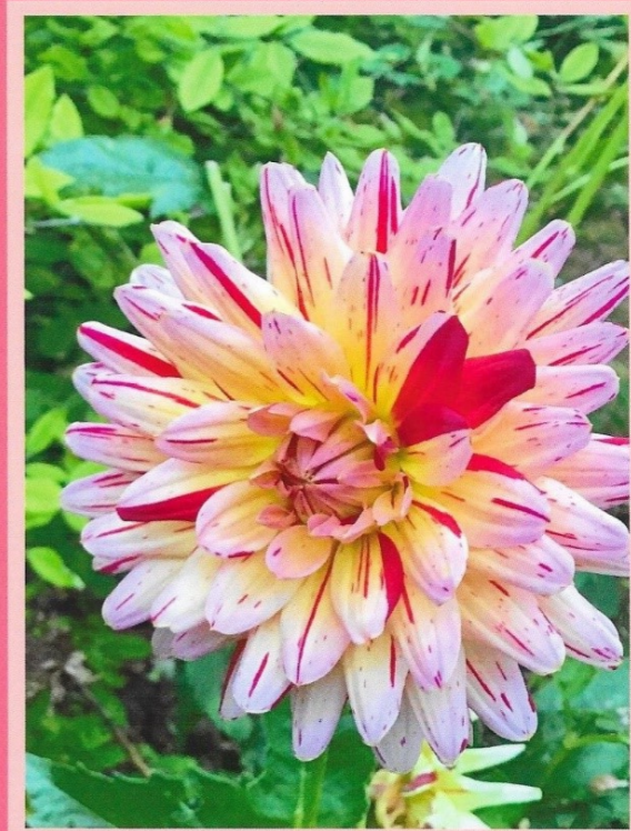
Ref # - 2024-08