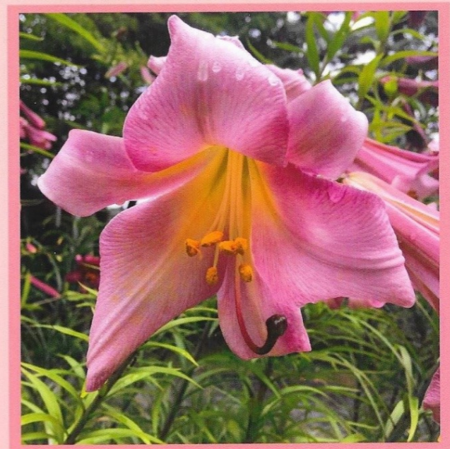
Ref # - 2024-04