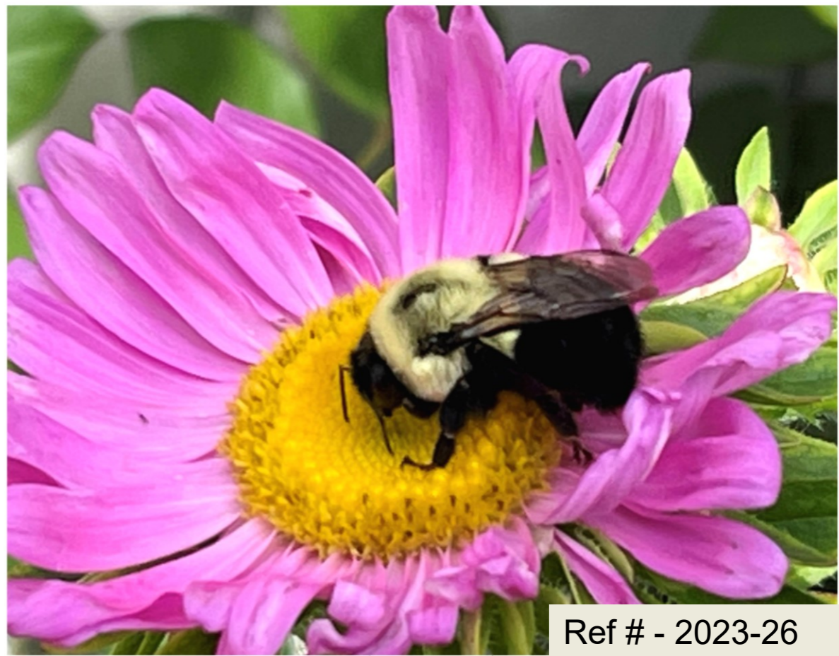
Ref # - 2023-26