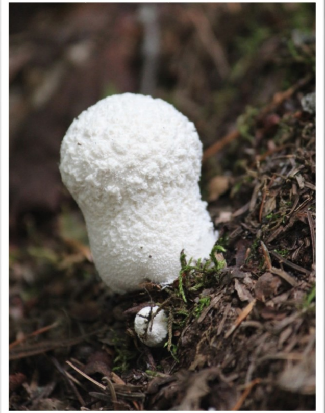
Ref # - 2023-33