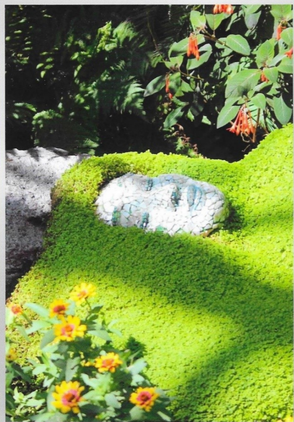
Ref # - 2024-07