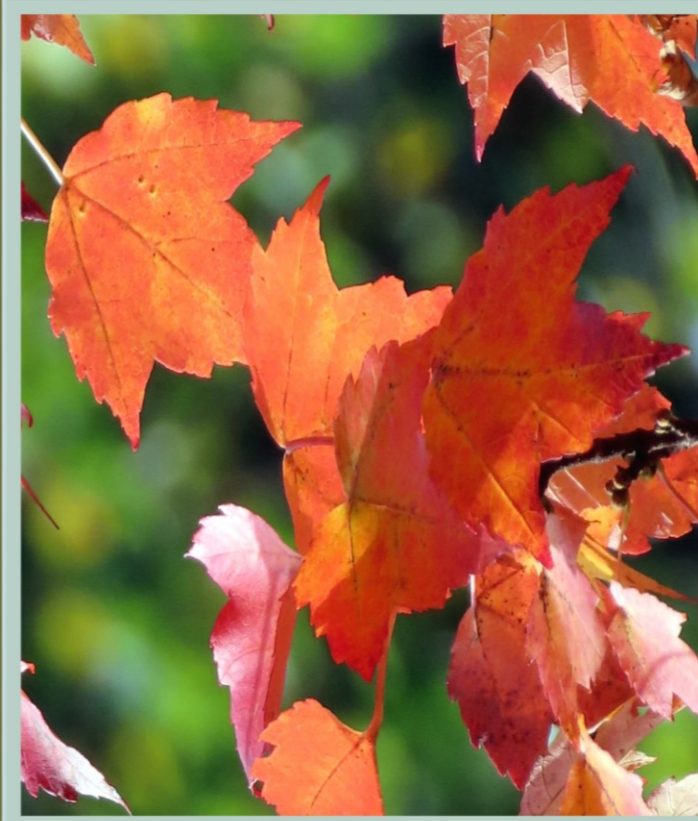
Ref # - 2023-32