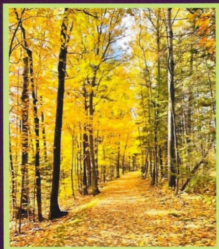
Ref # - 2024-15