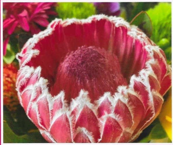
Ref # - 2024-05