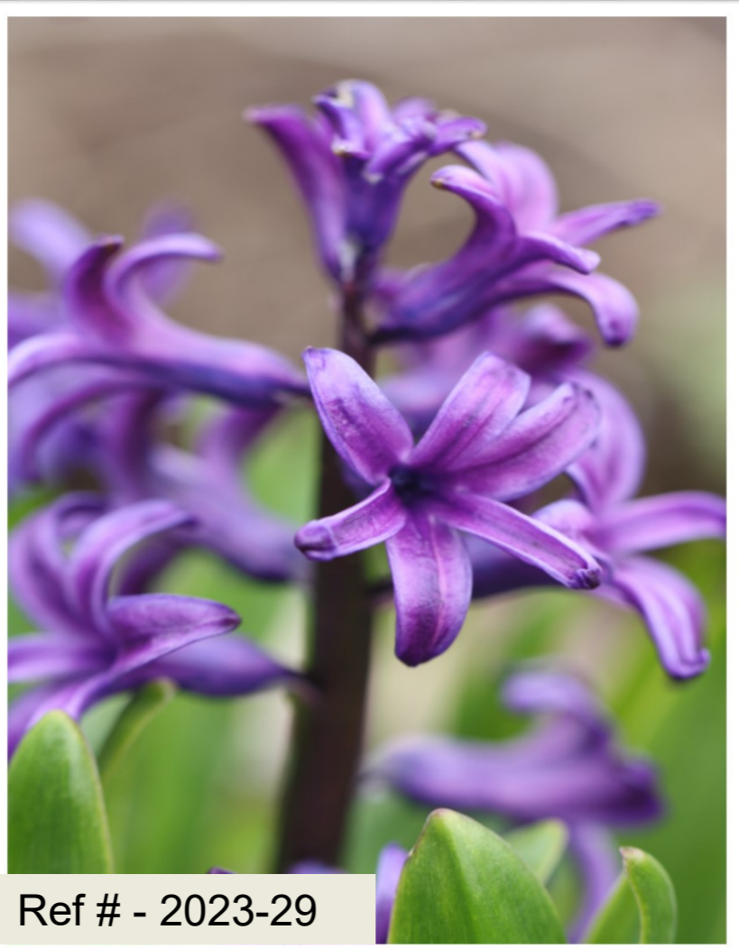
Ref # - 2023-29