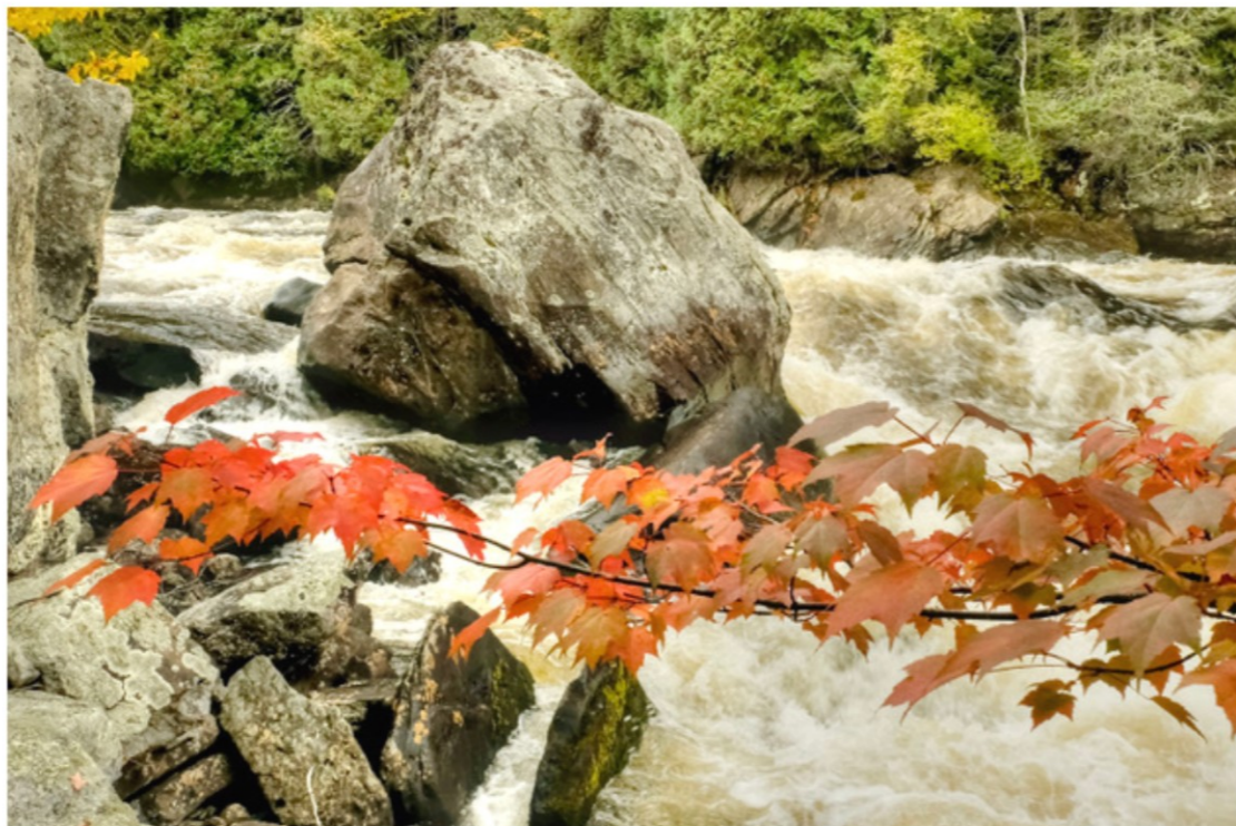
Ref # - 2023-34