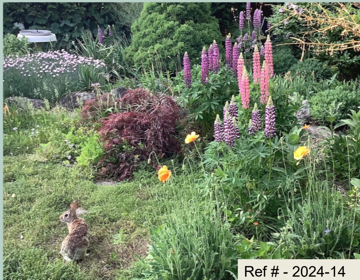
Ref # - 2024-14