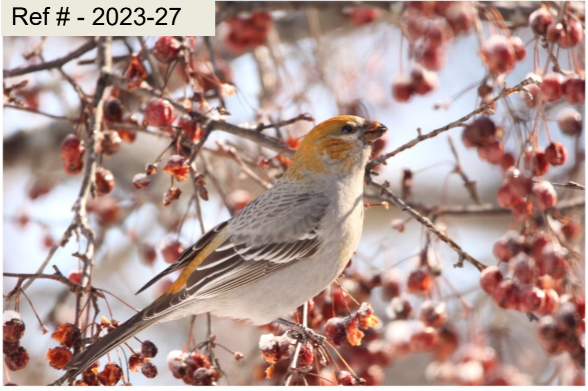
Ref # - 2023-27