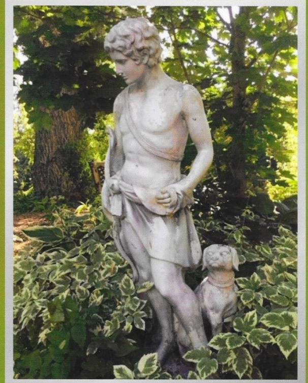
Ref # - 2024-06