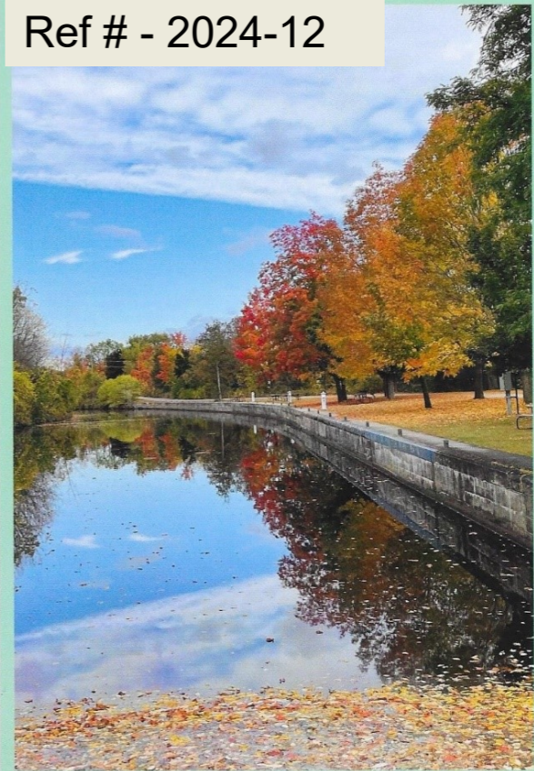
Ref # - 2024-12