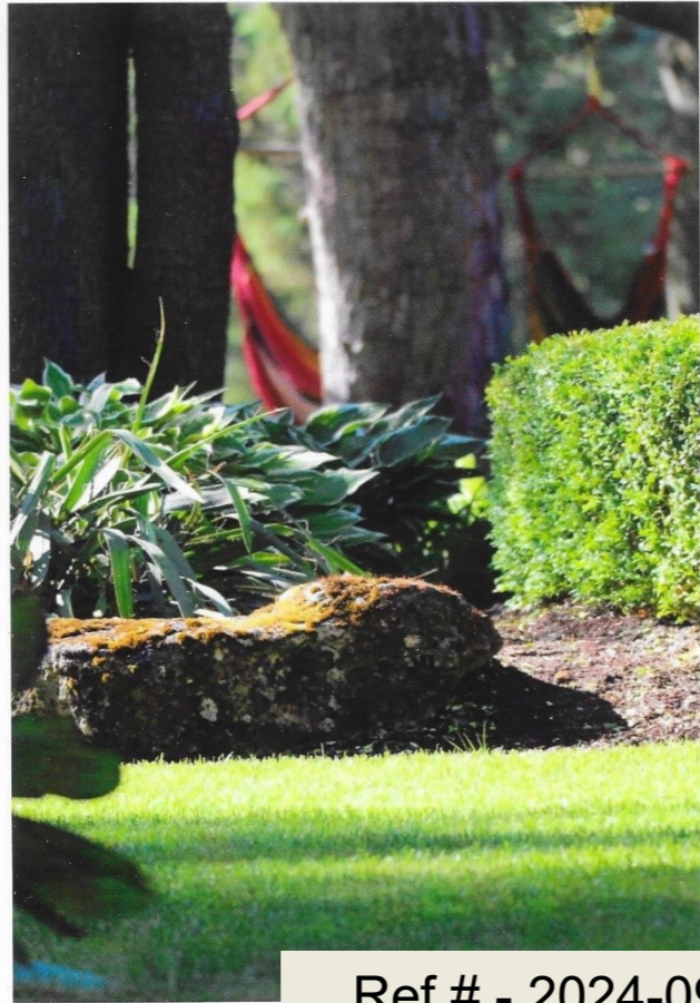
Ref # - 2024-09