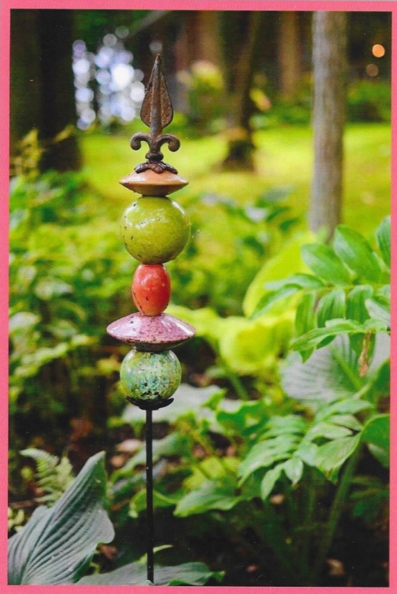
Ref # - 2024-01