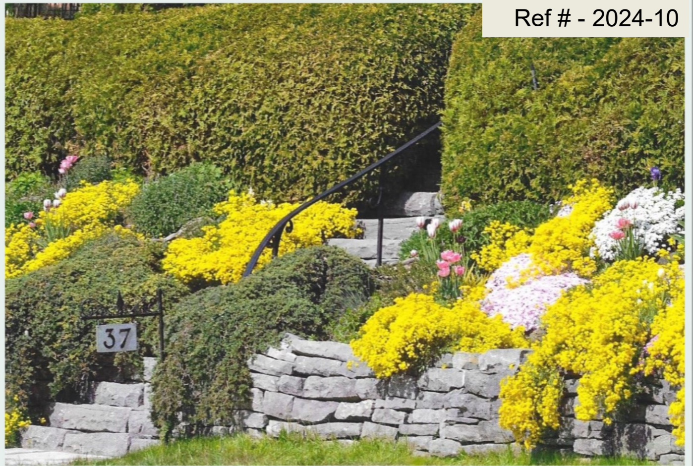
Ref # - 2024-10