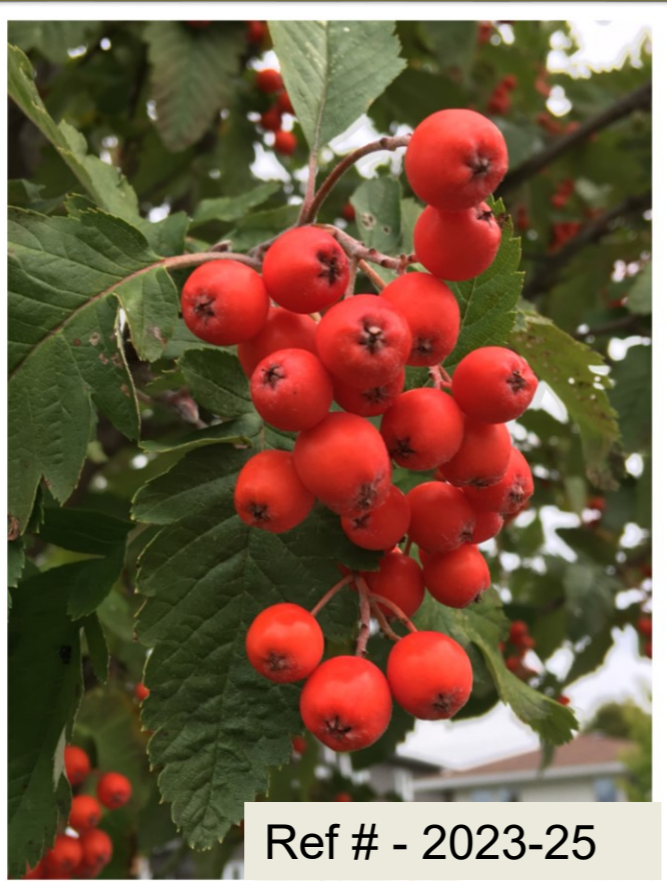
Ref # - 2023-25