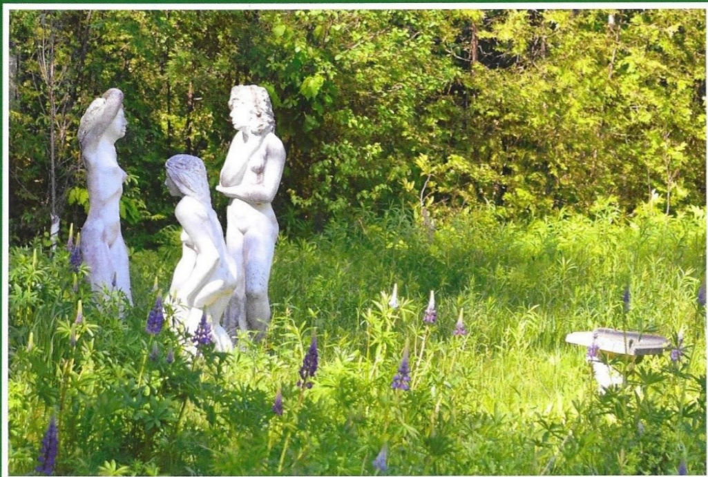
Ref # - 2024-03