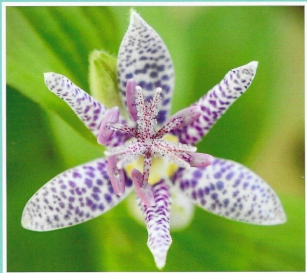
Ref # - 2024-13