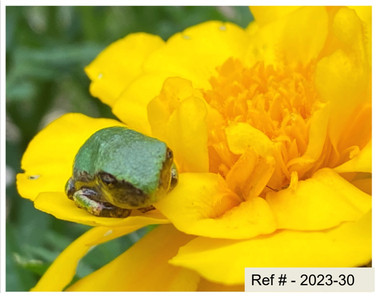
Ref # - 2023-30