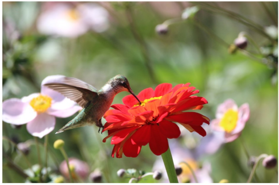
Ref # - 2023-31